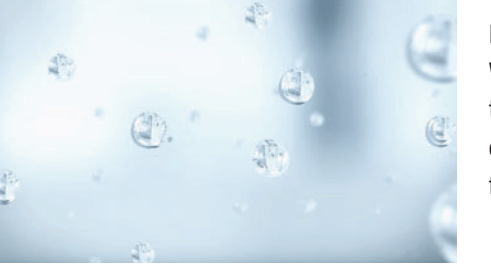
Degassing With the degassing mode available at the touch of a button, your samples are quickly and thoroughly degassed for further analysis.

Cleaning laboratory equipment Thanks to the easily recognisable display elements, you have maximum control over the cleaning process of your equipment at all times.