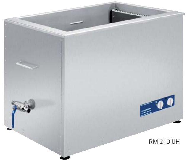
RM 210 UH