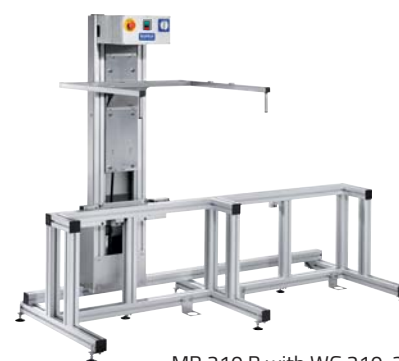
MB 210 B with WG 210-2